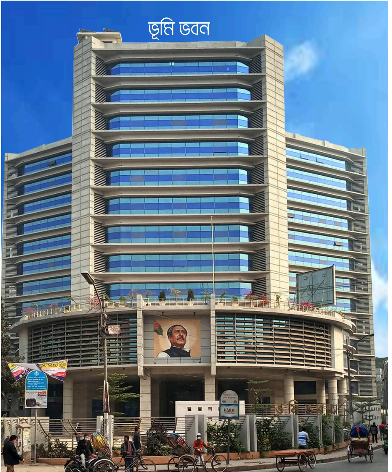
13-Storeyed Bhumi Bhaban Complex with 2-Basement