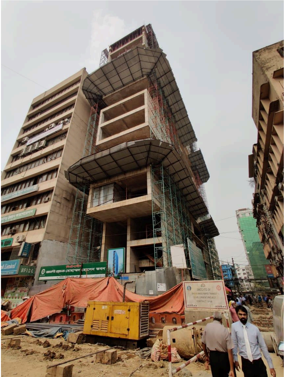
20-Storey Agrani Bank Bhaban-2 with three Basements at 72 Motijheel C/A, Dhaka.