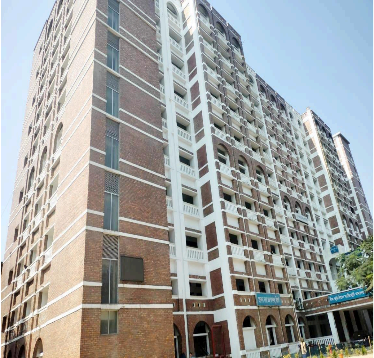
10 STORIED CHIEF JUDICIAL MAGISTRAGE COURT BUILDING AT SYLHET.