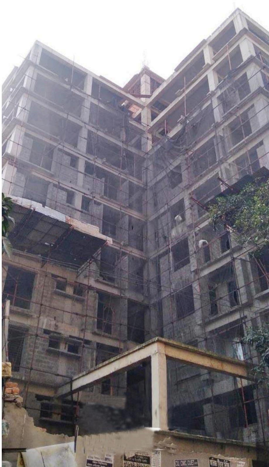
10- storied building at Abandoned House No-76/A-1, Road No-1, Nasirabad Housing Society.