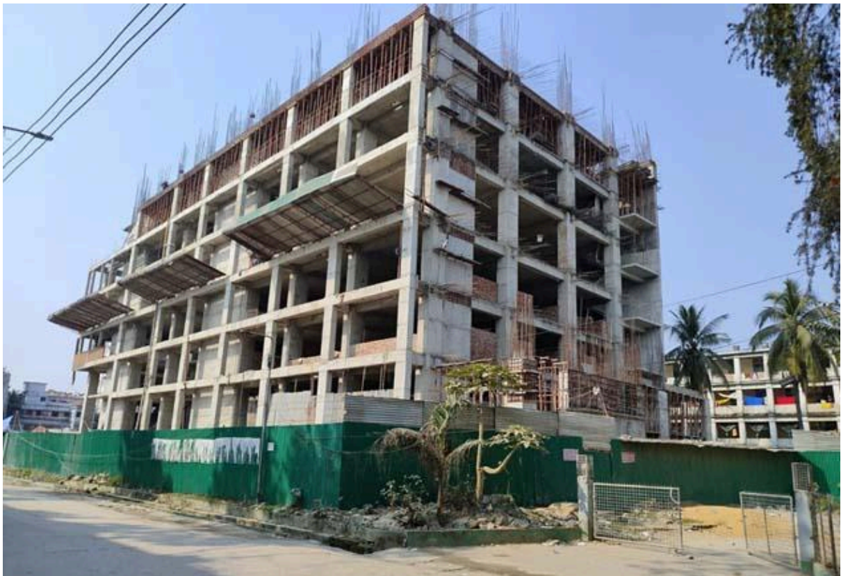
15 storied Cancer Hospital Building having 2-basement) at Mymensingh Medical College Hospital