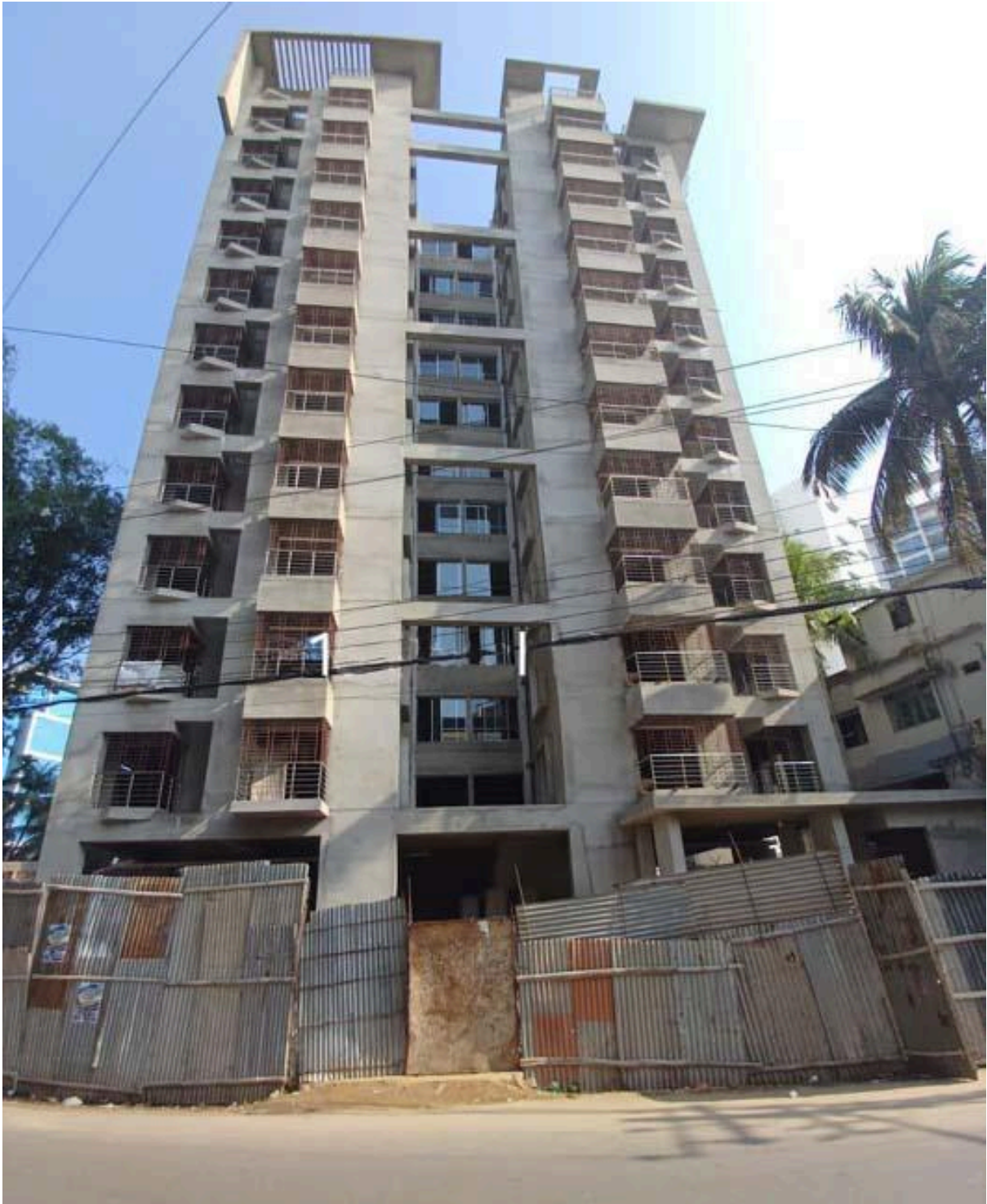
12-Storeyed Building at Abandoned House No-15 Panchlaish Residential Area