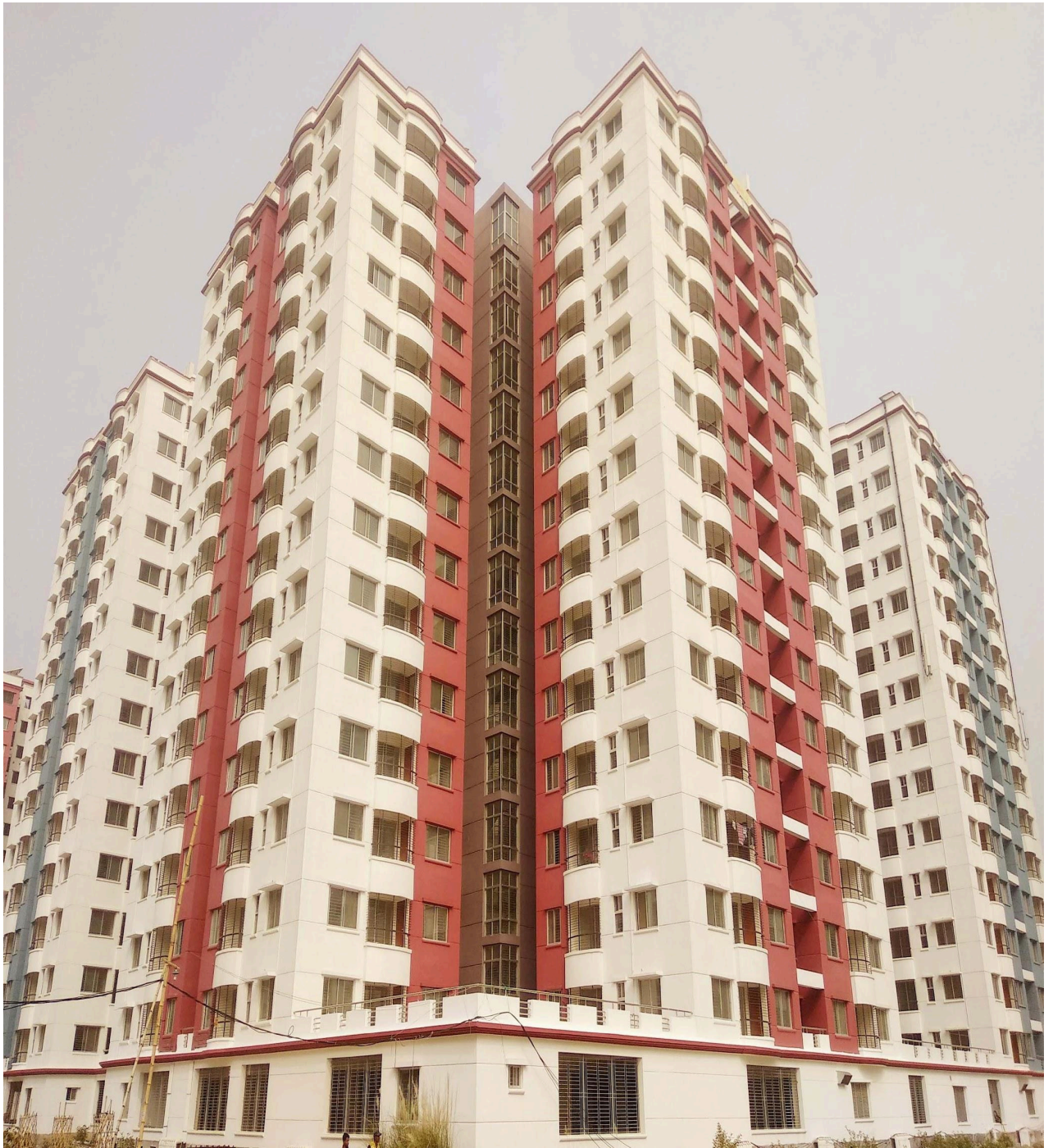
2(two) Nos. 16-Storeyed apartment (Type –A) Building Building No- 17(A) & 17 (B).