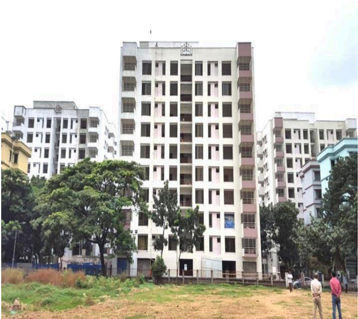
10 (Ten) storied Residential Flat Building New coloney, Lalmatia, Dhaka (Building # 3, 6, 7, 8)