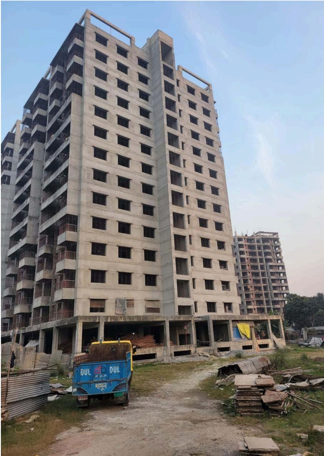
14 (fourteen) storied Flats building No 1 and 6 with Basement at Vasantek, Mirpur, Dhaka