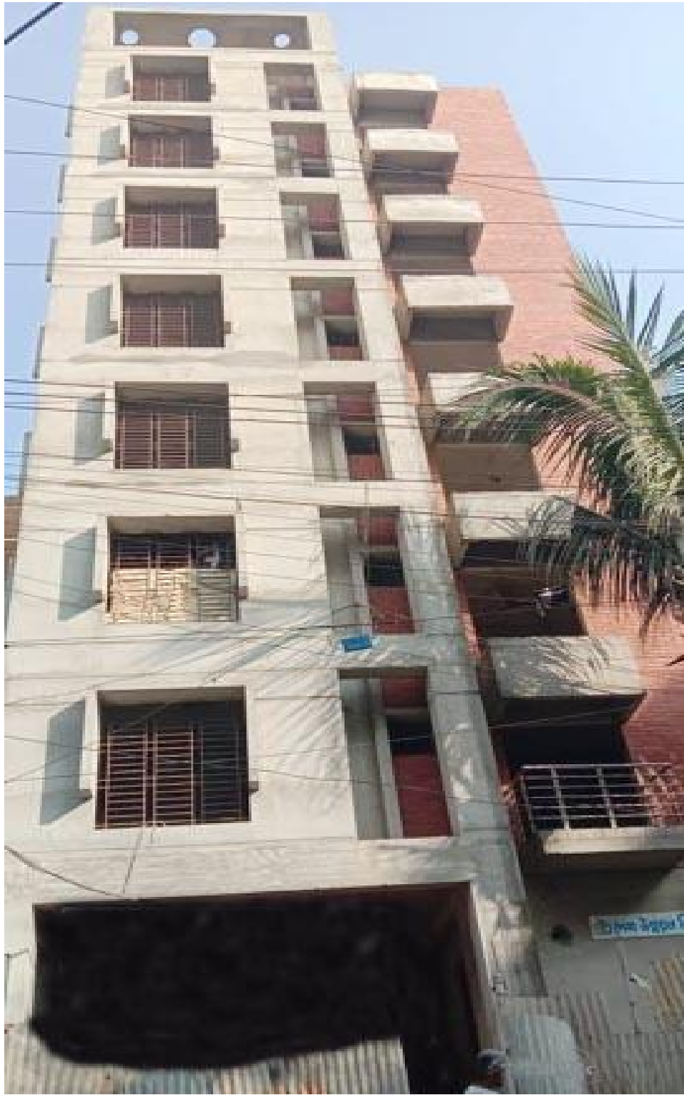
8- storied building at Abandoned House No-262, CDA Agrabad Road.