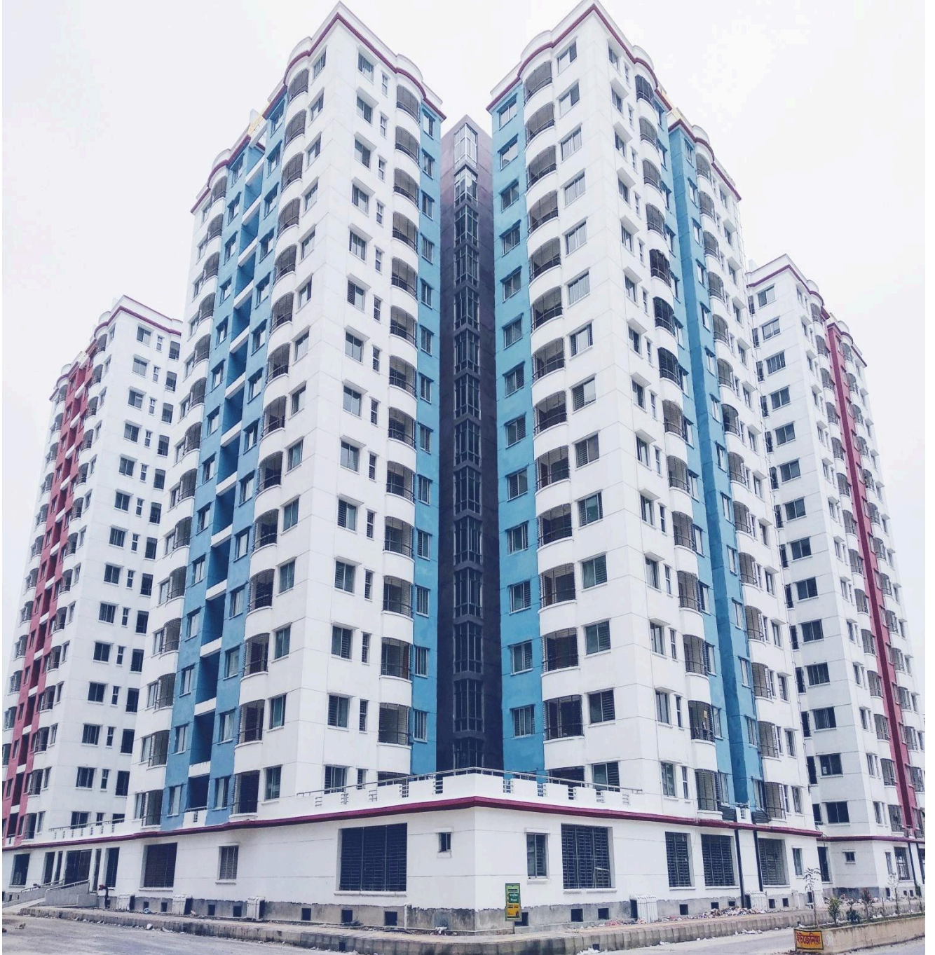
2(two) Nos. 16-Storeyed apartment (Type –A) Building Building No-17 (A) & 17(B)