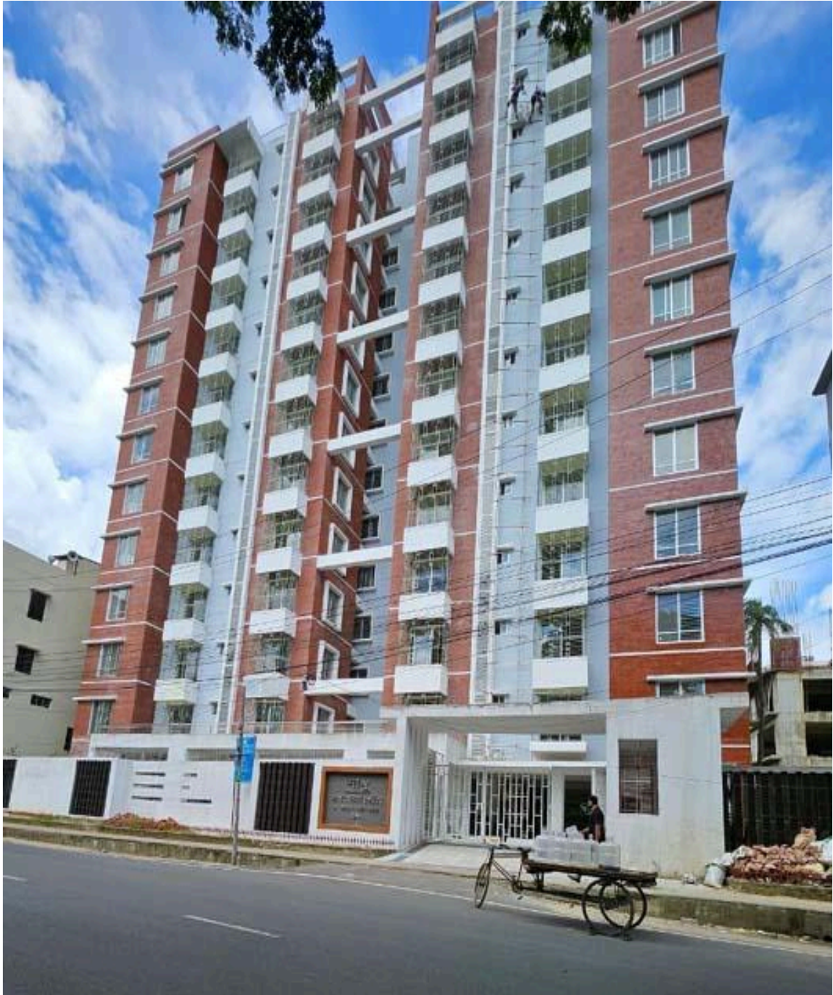
13-Storied Building at a Abandoned House No-95, Panchlaish Residential Area, Chittagong