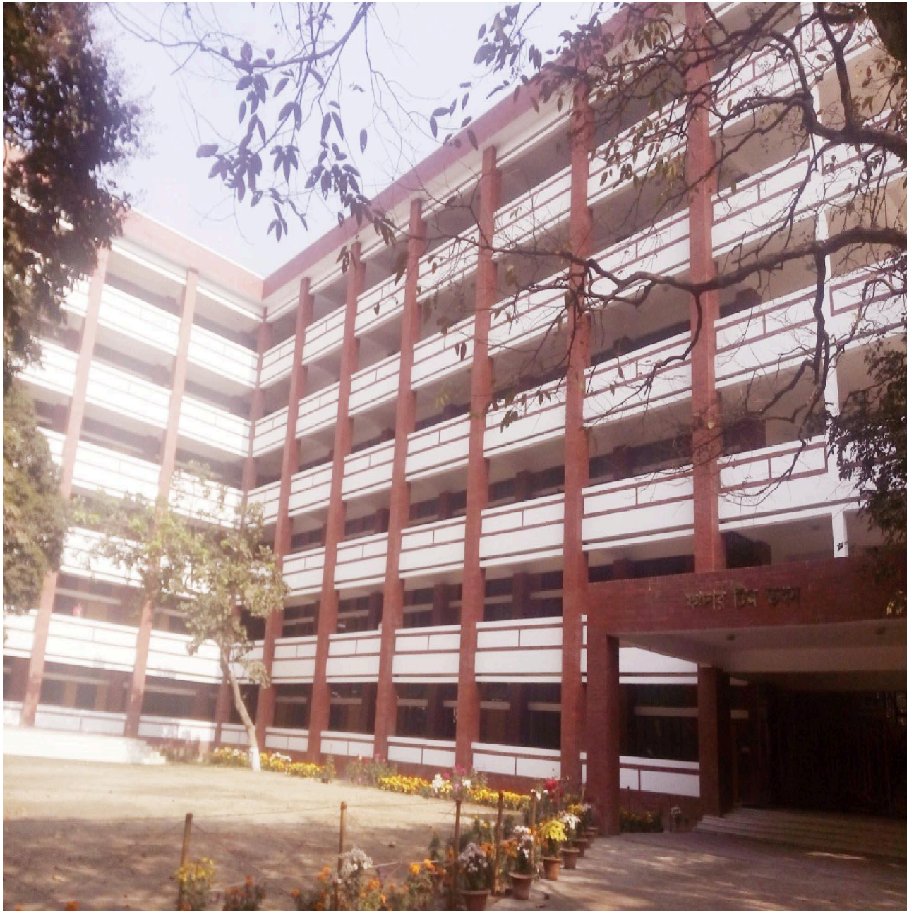
ACADEMIC BUILDING OF NOTORDAME COLLEGE AT ARAMBAGH, DHAKA