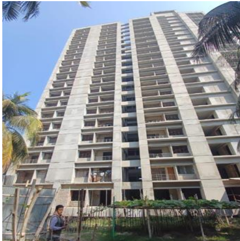
20 Storied Residential Tower Building at Dampara Police Line Chattogram.