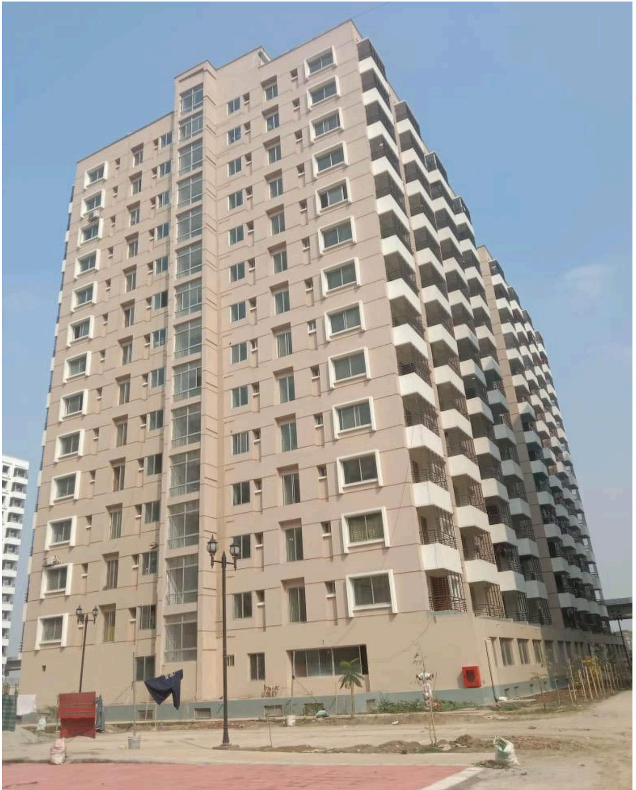
14 (Fourteen) storied Residential Flats Building Section-9, Mirpur, Dhaka (Single Basement + 14 Storey) (Building No.- 5)