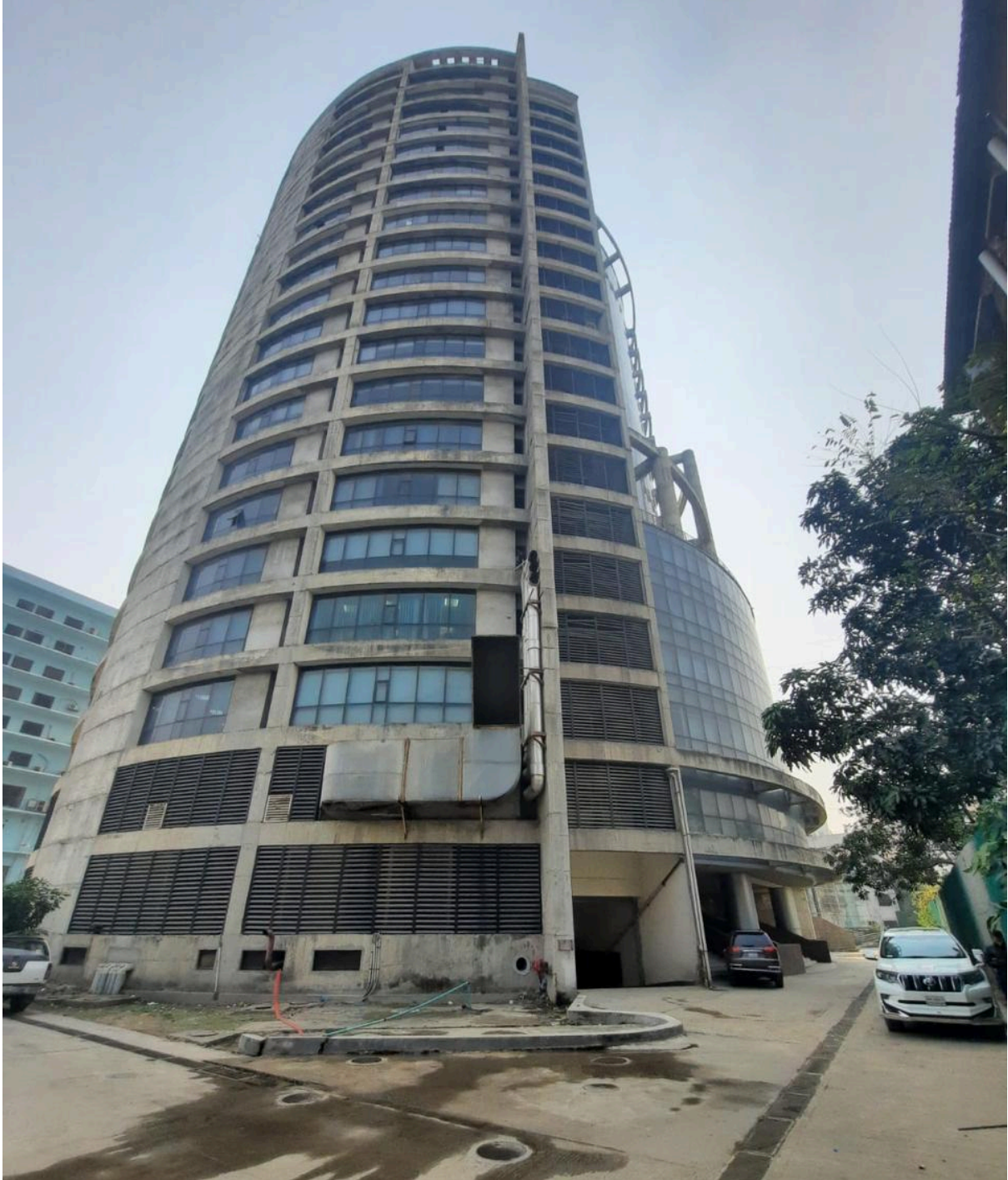
8 (Eight) Floors+ 2(two) with foundation of 20(twenty) storied building for PGCB Head Office Building, Rampura, Dhaka.