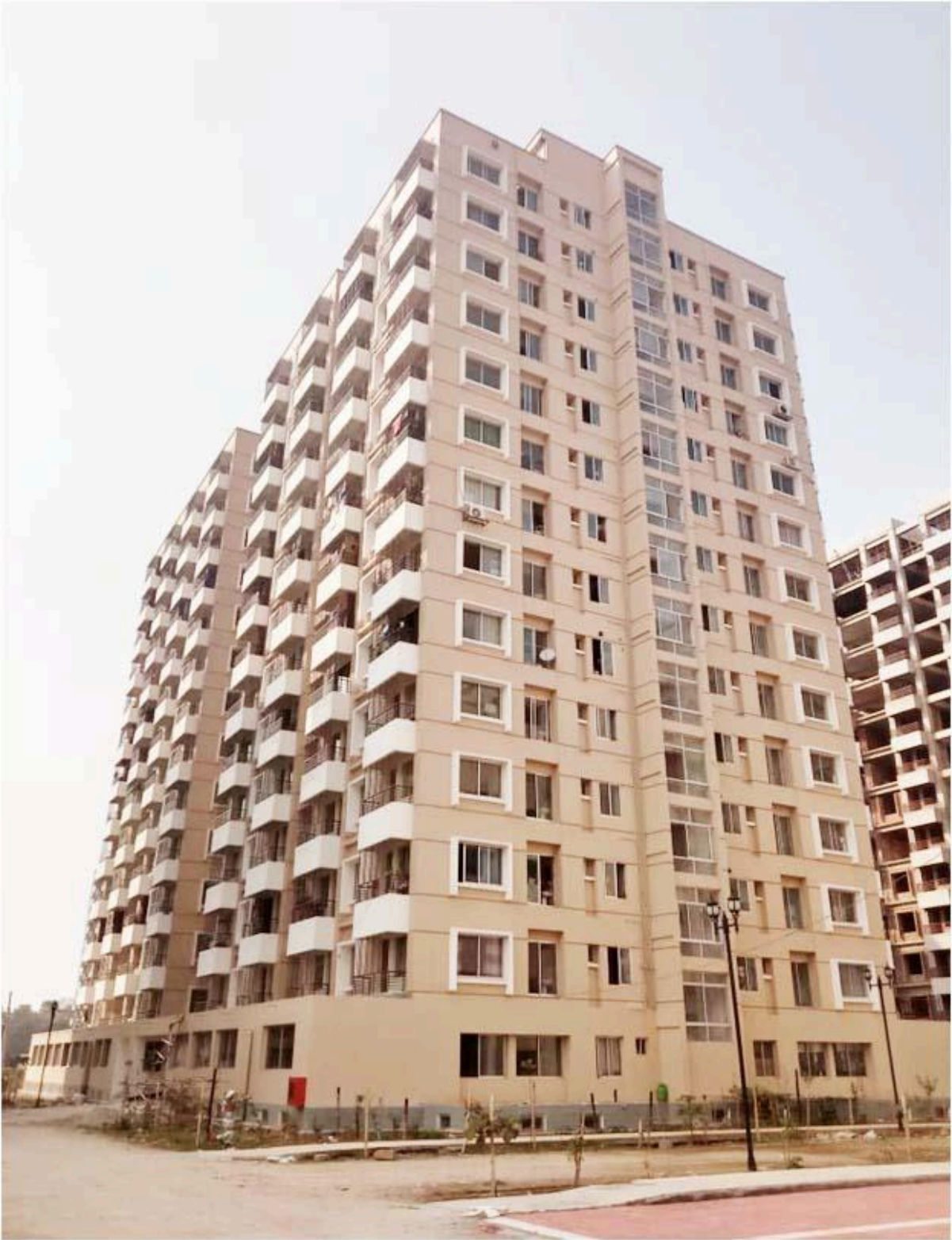
14 (Fourteen) storied Residential Flats Building Section-9, Mirpur, Dhaka (Single Basement + 14Storey) (Building No.- 6)