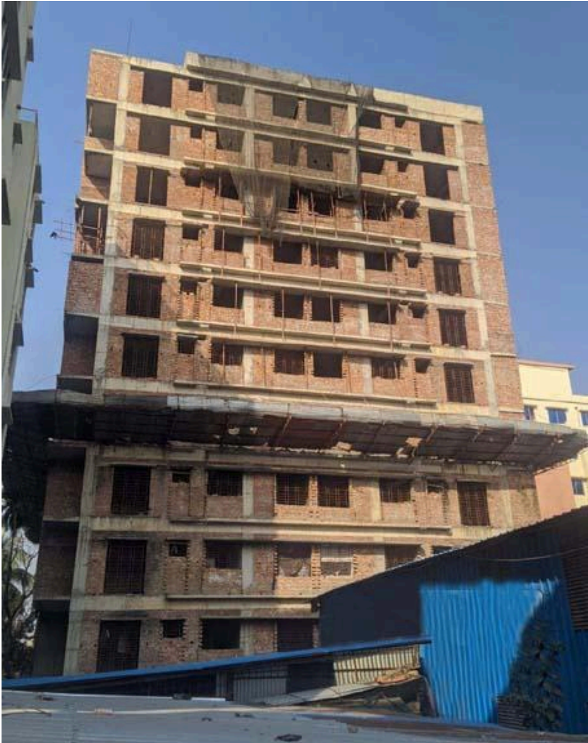
12-storied building at Abandoned House No-235, Sardar Bahadur Road, Khulshi Chattogram.